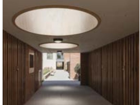
Materials > The use of warm and tactile materials within the entrance lobby creates a welcoming place to engage with neighbours